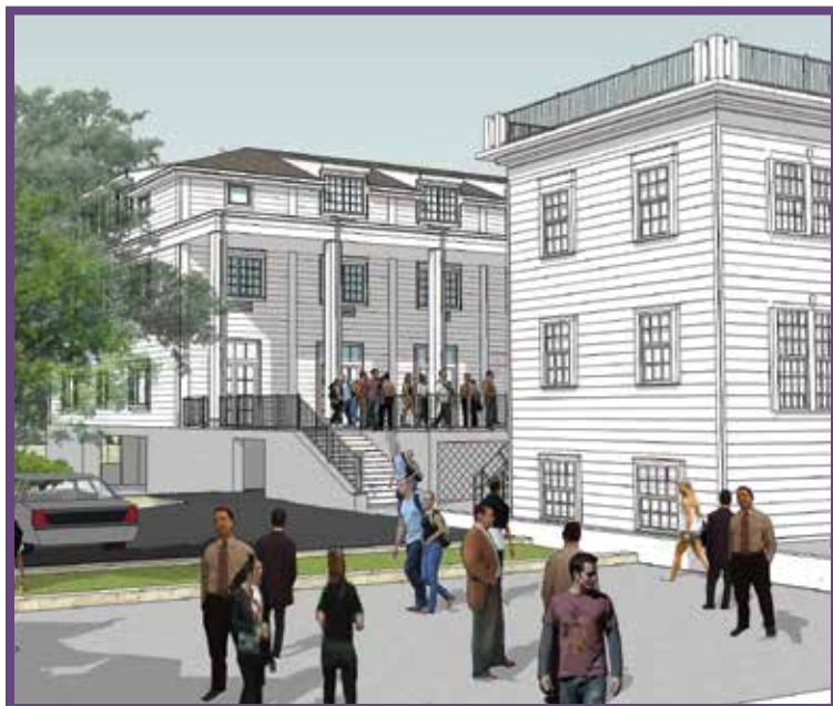
The expansion will allow for a growing Chapter and provide additional rooms and study and recreational areas.

Below are the pledge class participation percentages in Texas Fiji: Not for College Days Alone thus far.* Don't see your pledge class listed? Be the first to contribute by making a gift today.