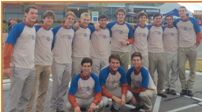
Brothers handed out water during a Ram Racing event as their first community service event this fall.

Over the course of the school year, we also look to continue our philanthropic activity and provide service to the local community. Fiji's involvement with Reading ACES, Feed My People, Race for the Cure, Habitat for Humanity, and RAM Racing has demonstrated our love for