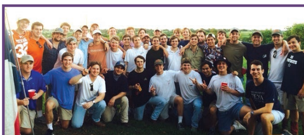
The 2013 class retreat occurred this summer.

In addition, last semester Fiji earned a GPA of 3.22. I attribute this success to the hard work and dedication of each of our members. They work together to encourage each other and push each other to accomplish our goals.