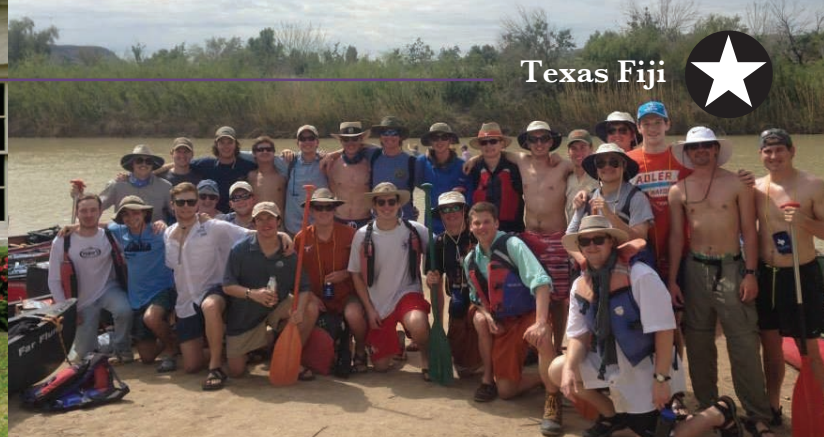
The 2013 junior class on the annual Big Bend canoe trip.