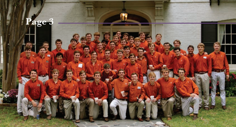
Texas Fiji members celebrate the annual Texas/OU weekend.