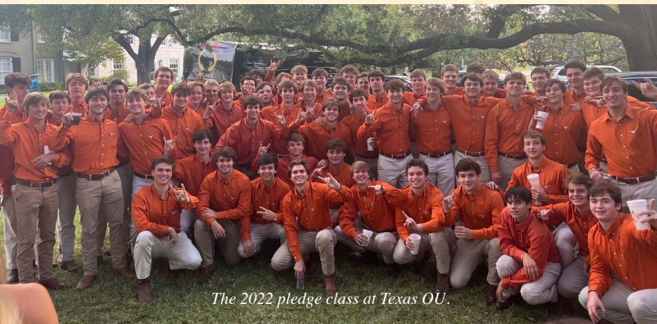
The 2022 pledge class at Texas OU.