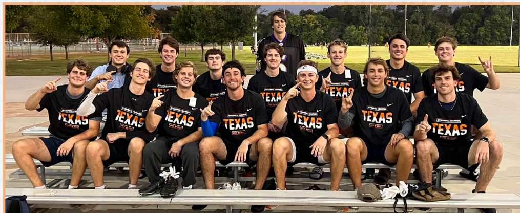
The 2020 pledge class's flag football team after winning the flag football championship for the junior class.