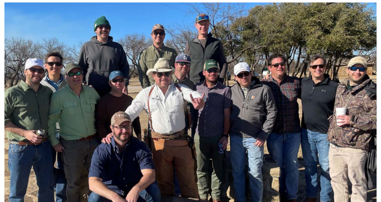
The pledge class of 2001 catches up on old times at Texas Ranch.