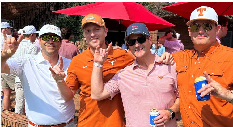
Members of the 2000 pledge class enjoy fellowship at the Fiji house in Tuscaloosa (34-24, Horns win!).