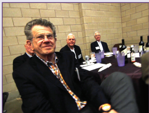
We had a superb showing of PC '55 graduate brothers, many of whom received their Gold Owl pins for continued involvement in the Chapter and Fraternity.