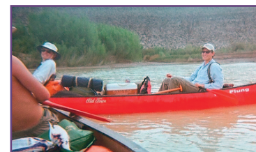
Brothers enjoy the annual sophomore spring break canoe trip through Big Bend.