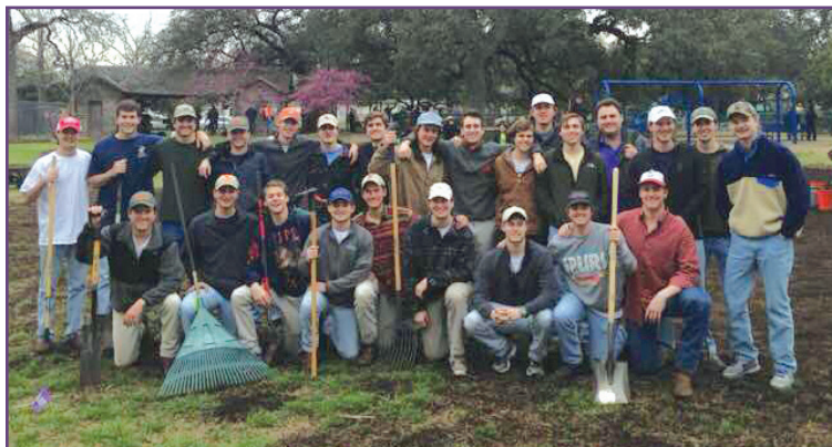
Nearly 40 brothers attended the Shipe Park Restoration Philanthropy Project in early March.