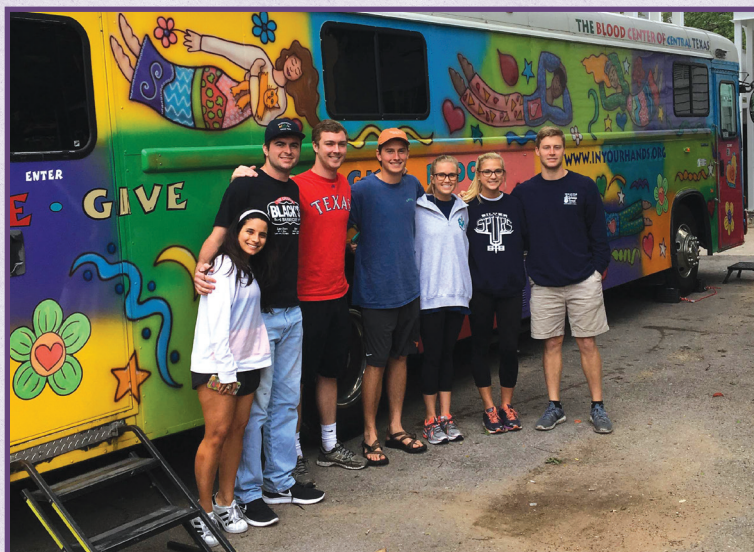
Texas Fiji held a blood drive supporting the Blood Center of Central Texas last spring.