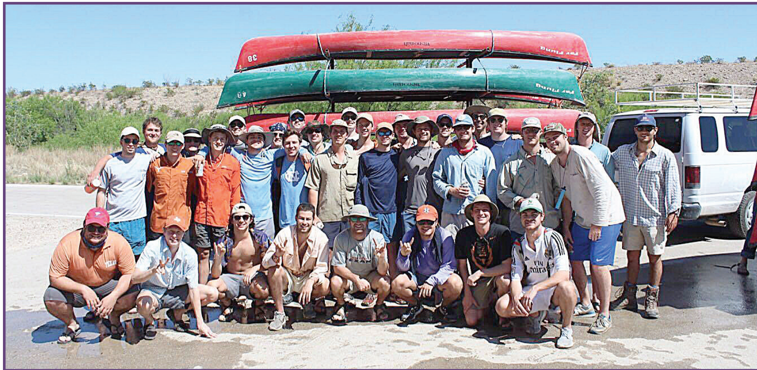
PC '15 fresh out of the water after their canoe trip through St. Elena Canyon.