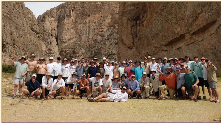
Left: Members of the 2016 pledge class in Telluride, Colo., on the annual Texas Fiji Ski Trip. Right: The 2017 pledge class on the annual sophomore canoe trip in Big Bend National Park. The group traveled 33 miles in three days on the Rio Grande River over spring break.