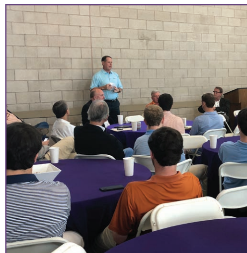
Tau Deuteron undergraduates learn from alumni during our career day.