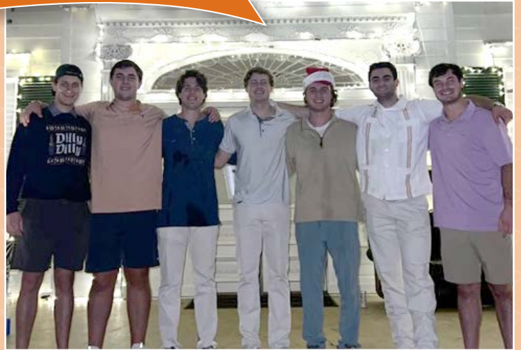
The executive board shares some Christmas spirit on the porch of Buen Retiro.

We've completed the feasibility study, and the necessary renovations are extensive given the needs of the growing active chapter and the overall state of the facility. The kitchen, for example, is almost obsolete; we are serving over 150 men per meal in a kitchen that was designed for 75.