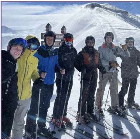
Members of the 2020 pledge class hit the slopes during the annual Fiji ski trip in Telluride, Colorado.