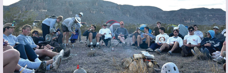
The pledge class of 2021 enjoying a magical float trip at Big Bend National Park.